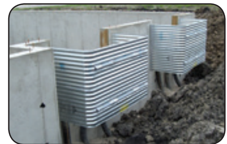
Window wells are connected to the drain tile system.

For more information or to request a seasonal waiver form, contact us at 701-461-7867 or download one from our Web site www.cityoffargo.com/wastewater .