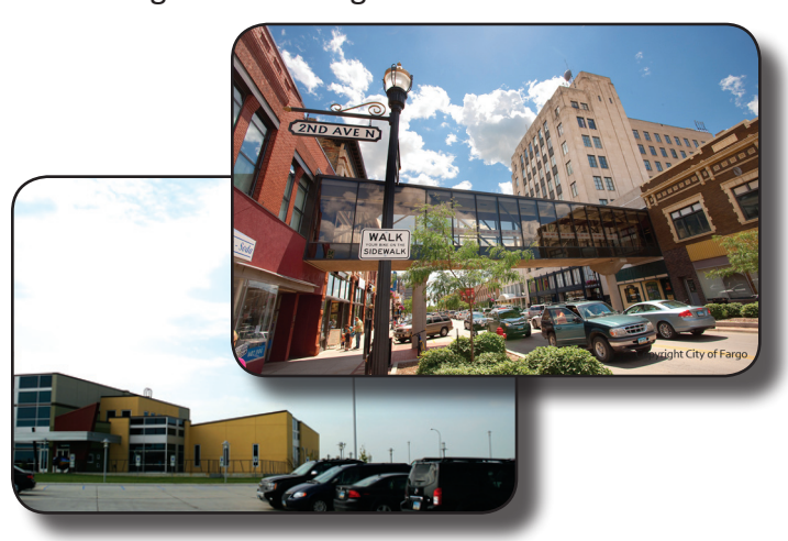
The NDSU Technology Park and revitalization of downtown Fargo were both key projects in the 1995 Comprehensive Plan.

The common vision established in the comprehensive plan will provide the primary direction for decision makers in the future. An ambitious comprehensive plan will boost Fargo's economy, improve its quality of life, and foster the advancement and prosperity for generations to come. With an engaged citizenry, a visionary City Commission and a robust private sector, Fargo can move together toward a better future. The last comprehensive plan, finished in 1995, provided critical direction for numerous accomplishments, including the downtown revitalization and the NDSU technology park. This plan will build on the successes of the past and create the next big ideas for Fargo's future.