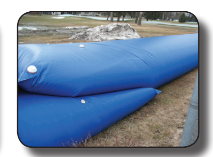
WIPP Water Inflated Property Protector