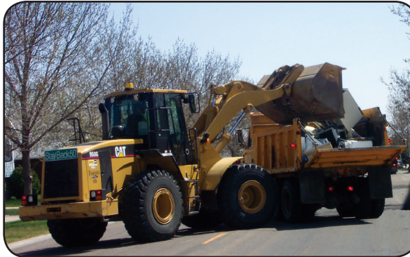
Crews collect large appliances during Cleanup Week.

For more information about Cleanup Week, visit www.cleanupweek.com .