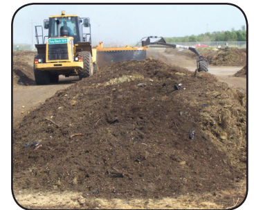
Compost pile at the HHW facility.

*Compost and wood chips are located west of the Household Hazardous Waste facility, 606 43 1/2 St. N. The small pile of compost that you can access to fill your own bags or cans is located next to the scale house at the landfill, 4501 7th Ave. N.