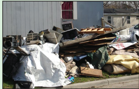
DO NOT place all items in one pile. Please separate.

Please follow the guidelines below during Cleanup Week: