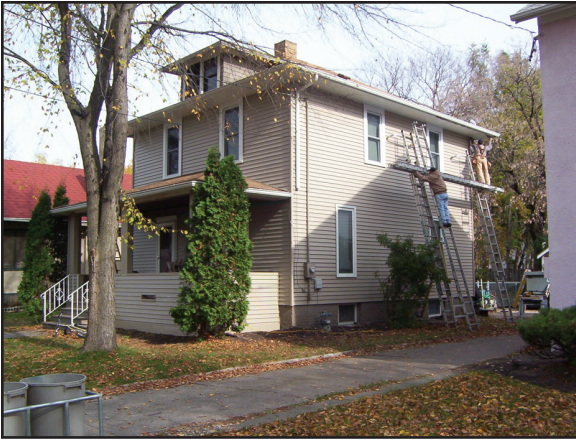
A home improvement project made possible with NRI assistance.

Now that spring is just around the corner, you may be thinking about a home improvement project. The Neighborhood Revitalization Initiative (NRI) could be just the ticket to help make your home improvement dreams come true. This program offers homeowners the opportunity for a low-interest home improvement loan. The City of Fargo and Gate City Bank have partnered on this program for the past 8 years and hundreds of homeowners have used it to make millions of dollars worth of improvements to their homes. If your house needs some work, why not check out the NRI home remodeling loan? More information can be found on the web at www.cityoffargo.com/nri or by calling Fargo Community Development at 241-1474.