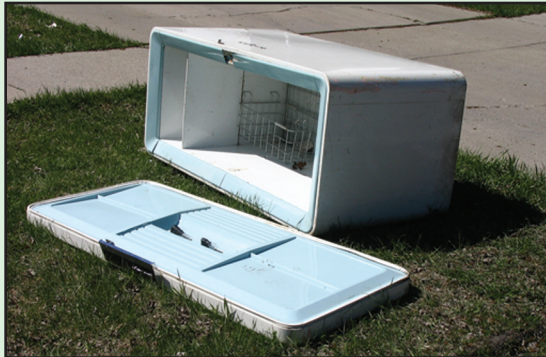
DO remove doors from appliances.

During the week of May 2-6, the Department of Solid Waste will collect extra garbage from your boulevard for no extra charge. Items will be picked up on your regular garbage day.