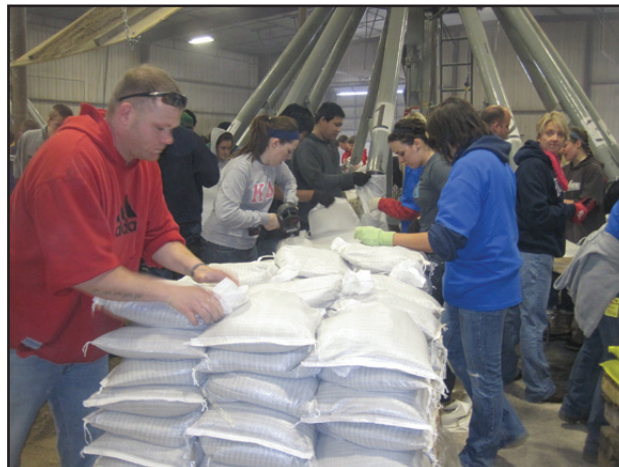
Volunteers fill sandbags using the spider machine.

opened Sandbag Central on February 14 and so far there has been an overwhelming show of support from residents. Individuals and volunteers from businesses, schools and universities have helped fill roughly 100,000 sandbags each day.