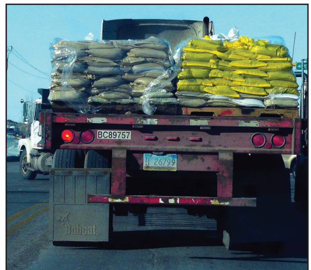
A semi trailer delivers filled sandbags to a sandbag storage site.

Sign up for CodeRed at www.cityoffargo.com/emergencies Stay tuned to local media