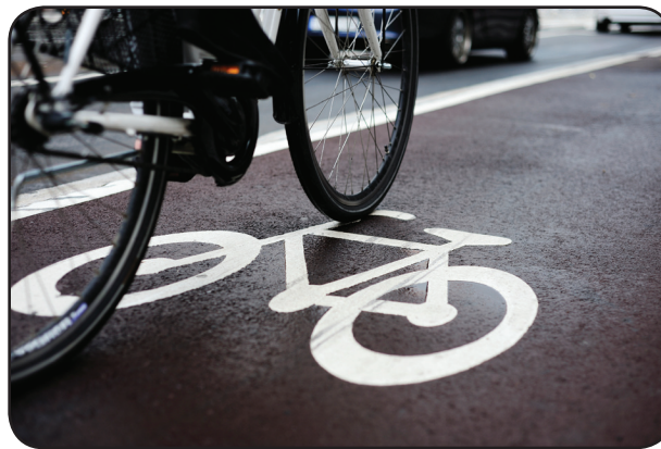
Bike lanes are marked with a stripe & bike symbol.