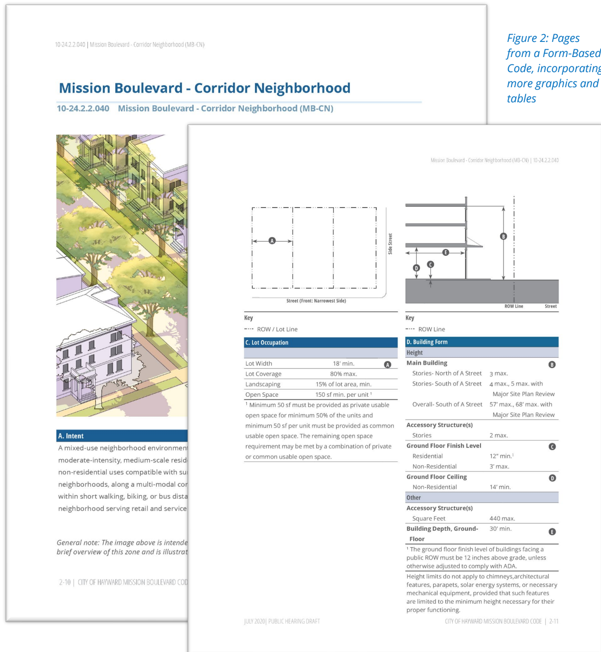
Figure 2: Pages from a Form-Based Code, incorporating more graphics and tables

This element considers the way the LDC is formatted and structured in the document overall and as well as on a page. Options range from no change from the existing structure to a complete reformat and reorganization of the LDC. Page layouts, restructuring, and design impact the simplicity and user-friendliness of a Code, as well as the timeline to complete the given Alternative depending on the degree of change. Figure 2 shows a sample of a code page layout with more graphics.