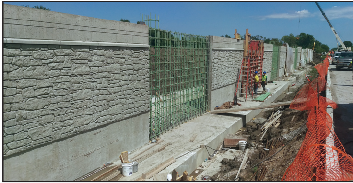
Floodwall construction at 40th Avenue South and 32nd Street.

Fargo engineers are expecting to wrap up another 3.5 miles of in-town flood protection this fall. That will bring the total miles of flood protection built in Fargo since 2009 to 19. Fargo Division Engineer Nathan Boerboom says this will have a significant impact during future spring flooding, “If we experienced a flood fight similar to 2009, we would need 4-million fewer sandbags.” Boerboom says crews have been focusing their attention on areas north of Rose Creek and along Drain 27 which runs parallel to 40th Avenue South, “Our goal is to begin removing properties from the floodplain in those areas in 2018.” These projects are part of the Citywide Comprehensive Plan which was developed to remove properties from the recently adopted FEMA floodplain which is a river stage of 39.5 feet.