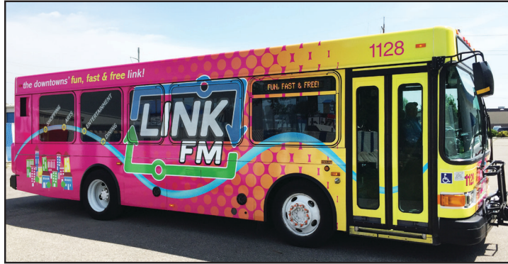
LinkFM operates Monday - Friday from 7 a.m. - 7 p.m. and Saturday from 10 a.m. - 5 p.m.

MATBUS recently launched its newest route, LinkFM. This fun, fast and free downtown circulator route connects the communities of Fargo and Moorhead. LinkFM, a partnership between the City of Fargo, the City of Moorhead and several local businesses and organizations, is easy to spot with its brightly colored wrap and LinkFM logo. Signs, including the new logo, are now in place at all LinkFM stops.