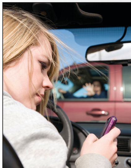
Car crashes are the leading cause of death among 14 - 18 year olds in the U.S.

Motor vehicle crashes are the leading cause of death for 14 - 18 year olds in the U.S. In fact, almost half of the teen drivers involved in a crash die. Yet, a recent survey shows that only 25% of parents have had a serious talk with their kids about the key components of driving (nhtsa.gov). You are the