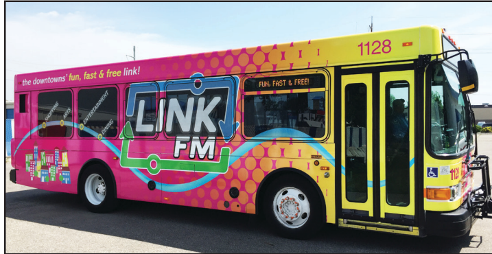
LinkFM operates Monday - Friday from 7 a.m. - 7 p.m. and Saturday from 10 a.m. - 5 p.m.

MATBUS recently launched its newest route, LinkFM. This fun, fast and free downtown circulator route connects the communities of Fargo and Moorhead. LinkFM, a partnership between the City of Fargo, the City of Moorhead and several local businesses and organizations, is easy to spot with its brightly colored wrap and LinkFM logo. Signs, including the new logo, are now in place at all LinkFM stops.