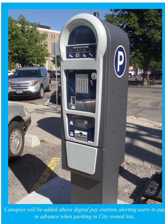
Canopies will be added above digital pay stations alerting users to pay in advance when parking in City owned lots.

their bill via card online at www.FargoParking.com or through Interstate's website at www.Payments.InterstateParking.com . A newly designed Fargo Parking website is expected to be launched and fully operational in mid to late September. Watch for more information to be announced soon!