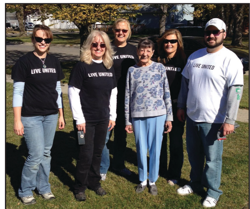
Day of Caring volunteers.

Projects may be indoor or outdoor activities and must be able to be completed within 2.5 hours (2 – 4:30 p.m.). This is a FREE service provided to you by caring volunteers through United Way of Cass-Clay. For information on this event, please visit our website at www.unitedwaycassclay.org or call 701-237-5050.