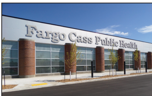
The new FCPH building will open in mid-September.