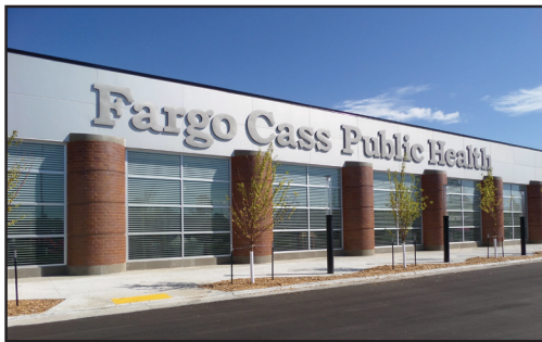
The new FCPH building will open in mid-September.

Fargo Cass Public Health will be in its new location on the corner of 25th Street and 13th Avenue South, (formerly SunMart) in Fargo by mid-September 2015. FCPH divisions, which were once spread throughout Fargo, will now be under one roof. The new location houses the Women’s Infant and Children nutritional program (WIC), Environmental Health, FCPH Clinic Services, Health Promotion, and FCPH Nursing as well as administrative offices. The new location also boasts a larger parking lot, teaching kitchen, community meeting rooms and is a stop on MATBUS routes.