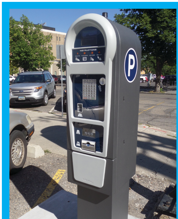
Canopies will be added above digital pay stations alerting users to pay in advance when parking in City owned lots.

Monthly renters are now able to manage their account online and pay their bill via card online at www.FargoParking.com or through Interstate's website at www.Payments.InterstateParking.com . A newly designed Fargo Parking website is expected to be launched and fully operational in mid to late September. Watch for more information to be announced soon!