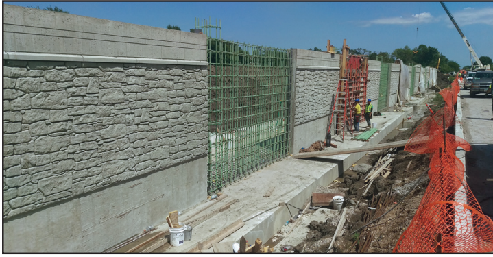
Floodwall construction at 40th Avenue South and 32nd Street.

Fargo engineers are expecting to wrap up another 3.5 miles of in-town flood protection this fall. That will bring the total miles of flood protection built in Fargo since 2009 to 19. Fargo Division Engineer Nathan Boerboom says this will have a significant impact during future spring flooding. “If we experienced a flood fight similar to 2009, we would need 4-million fewer sandbags.” Boerboom says crews have been focusing their attention on areas north of Rose Creek and along Drain 27 which runs parallel to 40th Avenue South, “Our goal is to begin removing properties from the floodplain in those areas in 2018.” These projects are part of the Citywide Comprehensive Plan which was developed to remove properties from the recently adopted FEMA floodplain which is a river stage of 39.5 feet.