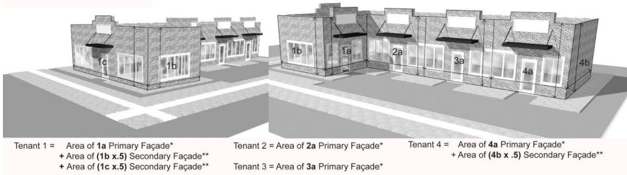
Calculating Allowable Signage by the Building Façade Area

3. Multiple Story Buildings. Additional signage is permitted in all zoning districts except UMU, SR, MR, and AG according to the following: