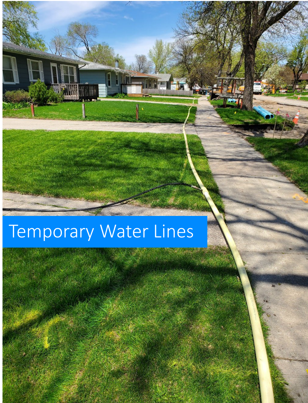
Temporary Water Lines