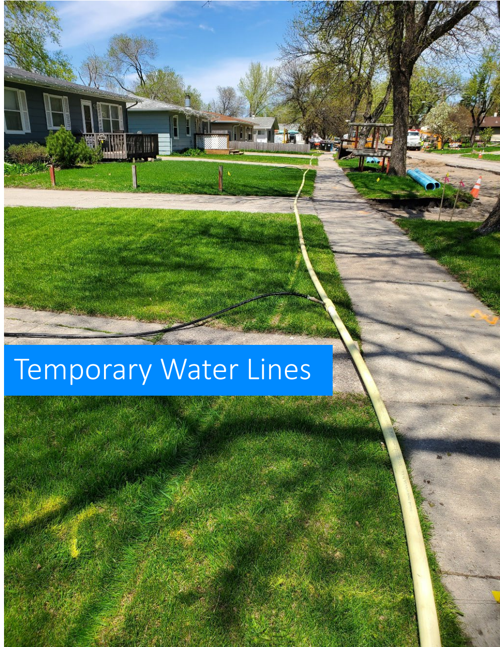
Temporary Water Lines