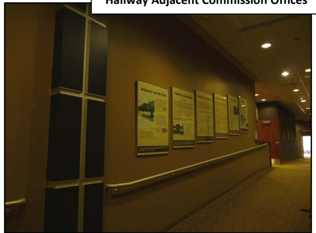
Hallway Adjacent Commission Offices

Location: The preferred location for an exhibit would be the hallway adjacent the Commission Offices. Although the existing displays would need to be moved, this is the only location within City Hall with a hanging system. Artwork will also be protected from direct sunlight.