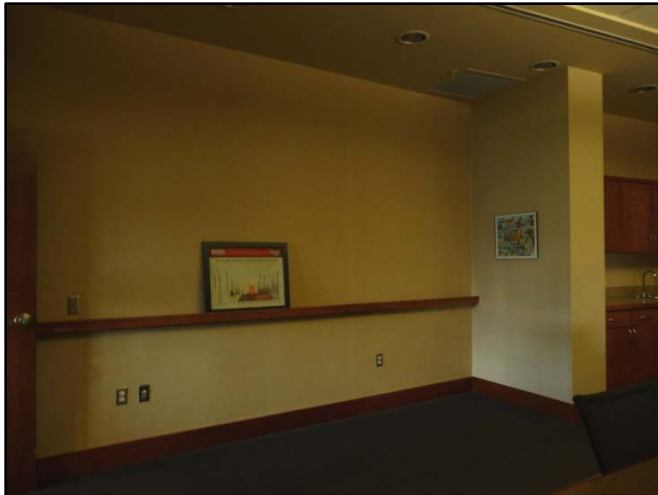
Large Meeting Rooms