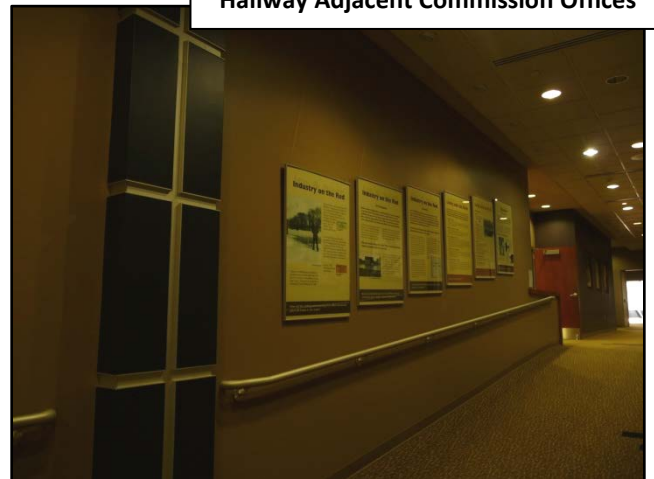
Hallway Adjacent Commission Offices

Location: The preferred location for an exhibit would be the hallway adjacent the Commission Offices. Although the existing displays would need to be moved, this is the only location within City Hall with a hanging system. Artwork will also be protected from direct sunlight.