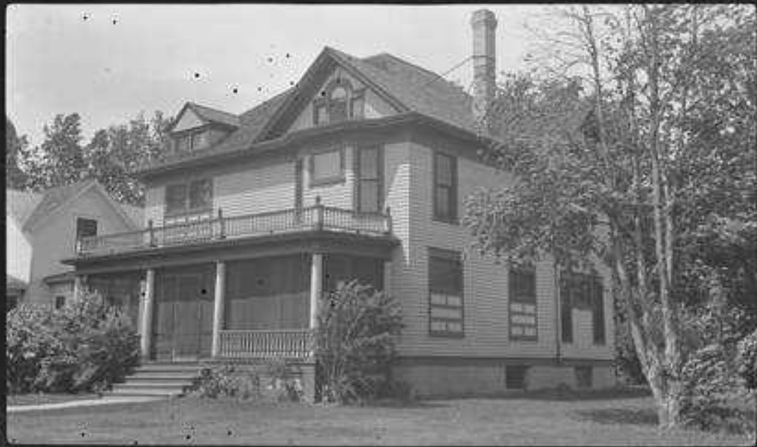
NDSU Institute for Regional Studies